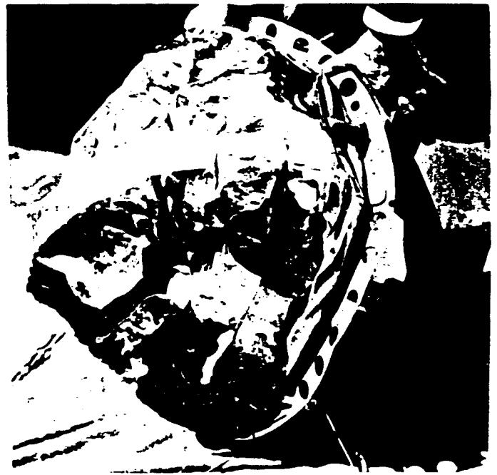
Sold to the U. S. Air Force