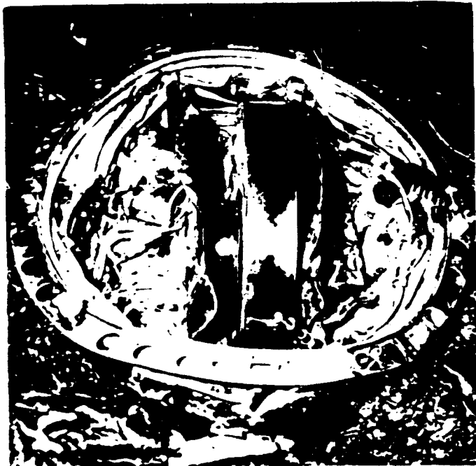
On location in La Fria, Táchira