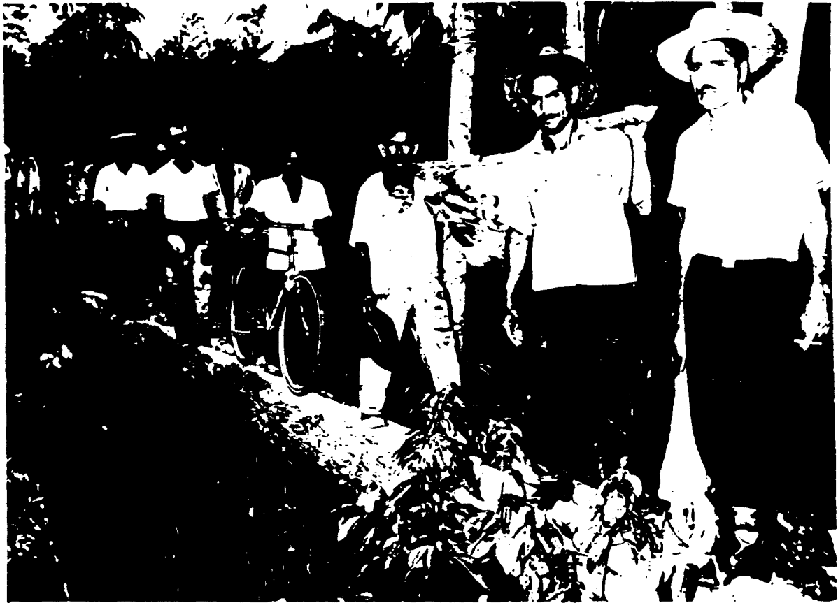
SRV being carried out of La Fria on foot by Campesinos